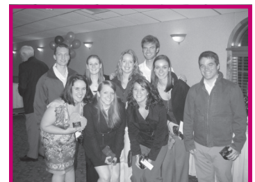
Student Volunteers From The Meelia Center

Main Office 19 Harvey Road Bedford, NH 03110 622-4948 Fax 384-3901